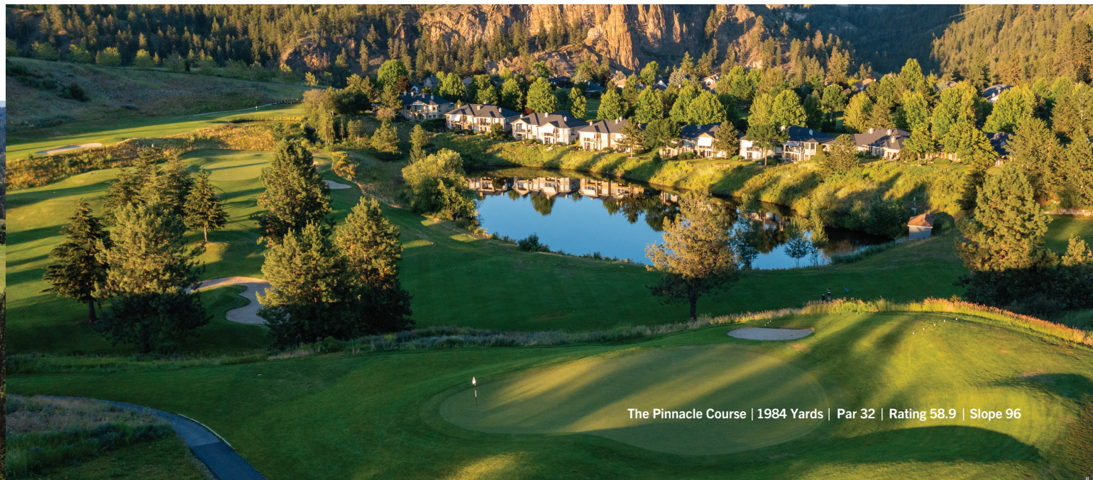
The Pinnacle Course | 1984 Yards | Par 32 | Rating 58.9 | Slope 96

An adventure in contrasts, the manicured fairways and stately pines beautifully juxtapose themselves against the rugged, rocky charms of the Canyon.