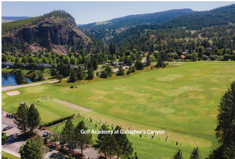
Golf Academy at Gallagher's Canyon

Discover why Gallagher's Canyon is ranked among the top golf courses in Canada. For more information visit: gallagherscanyon.com