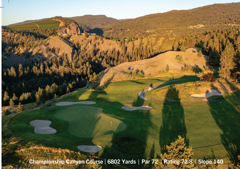
Championship Canyon Course | 6802 Yards | Par 72 | Rating 72.8 | Slope 140